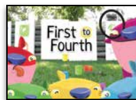
First to Fourth Level: 04 (foundation +) Themes: number & place value ISBN: 978 1 74144 395 0