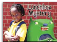
Lunchbox Mystery Level: 06 (foundation +) Themes: number & place value ISBN: 978 1 74144 396 7