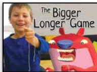
The Bigger, Longer Game Level: 07 (foundation +) Themes: units of measure ISBN: 978 1 74144 384 4