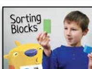
Sorting Blocks Level: 03 (foundation +) Themes: representation & interpretation ISBN: 978 1 74144 378 3