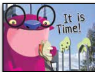
It is Time! Level: 06 (foundation +) Themes: units of measure ISBN: 978 1 74144 377 6