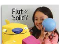
Flat or Solid? Level: 04 (foundation +) Themes: 2D & 3D shape ISBN: 978 1 74144 390 5