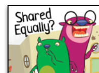
Shared Equally? Level: ages 7+ Themes: division ISBN: 978 1 74144 380 6