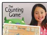
The Counting Game Level: 02 (foundation +) Themes: number & place value ISBN: 978 1 74144 391 2