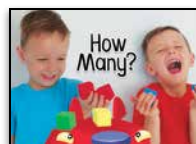
How Many? Level: 03 (foundation +) Themes: number & place value ISBN: 978 1 74144 392 9