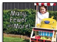
Many, Fewer and More! Level: 03 (foundation +) Themes: number & place value ISBN: 978 1 74144 393 6