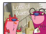
Lots of Boxes Level: ages 7+ Themes: multiplication ISBN: 978 1 74144 382 0