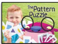
The Pattern Puzzle Level: 03 (foundation +) Themes: patterns & algebra ISBN: 978 1 74144 397 4