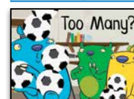
Too Many? Level: ages 7+ Themes: addition ISBN: 978 1 74144 381 3