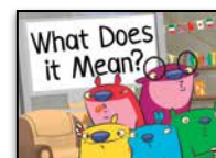
What Does It Mean? Level: ages 7+ Themes: equals ISBN: 978 1 74144 383 7