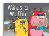
Minus a Muffin Level: ages 7+ Themes: subtraction ISBN: 978 1 74144 379 0