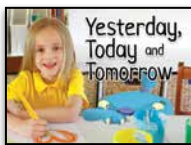
Yesterday, Today and Tomorrow Level: 06 (foundation +) Themes: units of measure ISBN: 978 1 74144 394 3