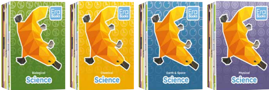
Covering your K-3+ science needs!

Shortlisted in the 2016 Educational Publishing Australia Awards.