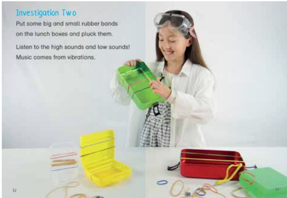
What is Sound?

Shortlisted in the 2016 Educational Publishing Australia Awards