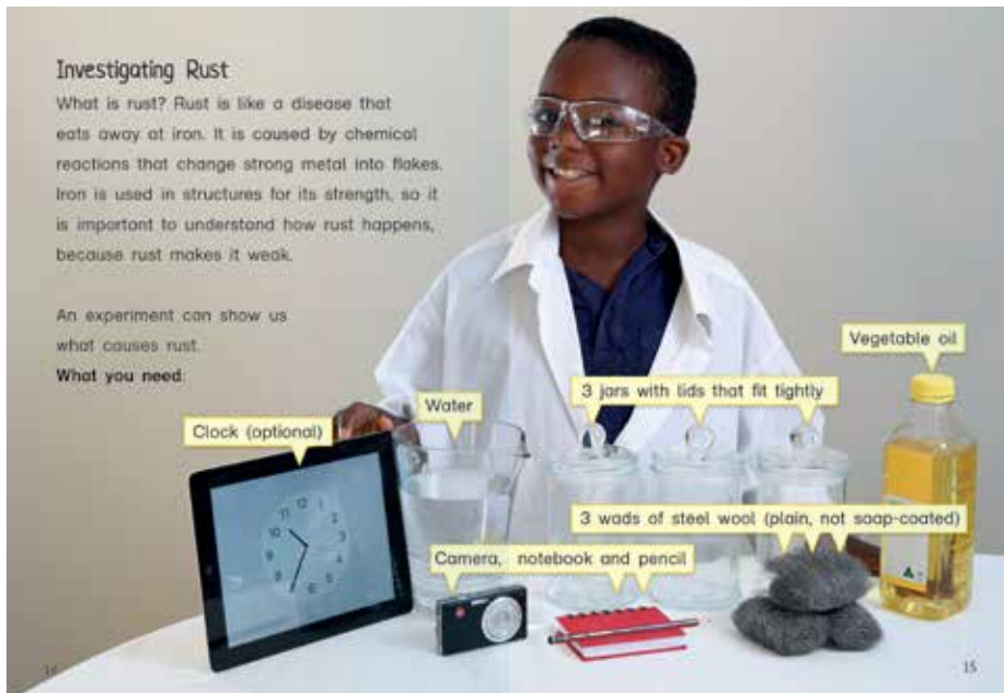
Metals and their Uses